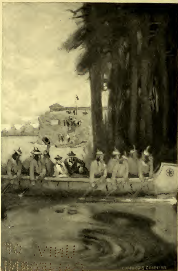
La Longue Traverse, "We take it together," he replied. (Page 260)